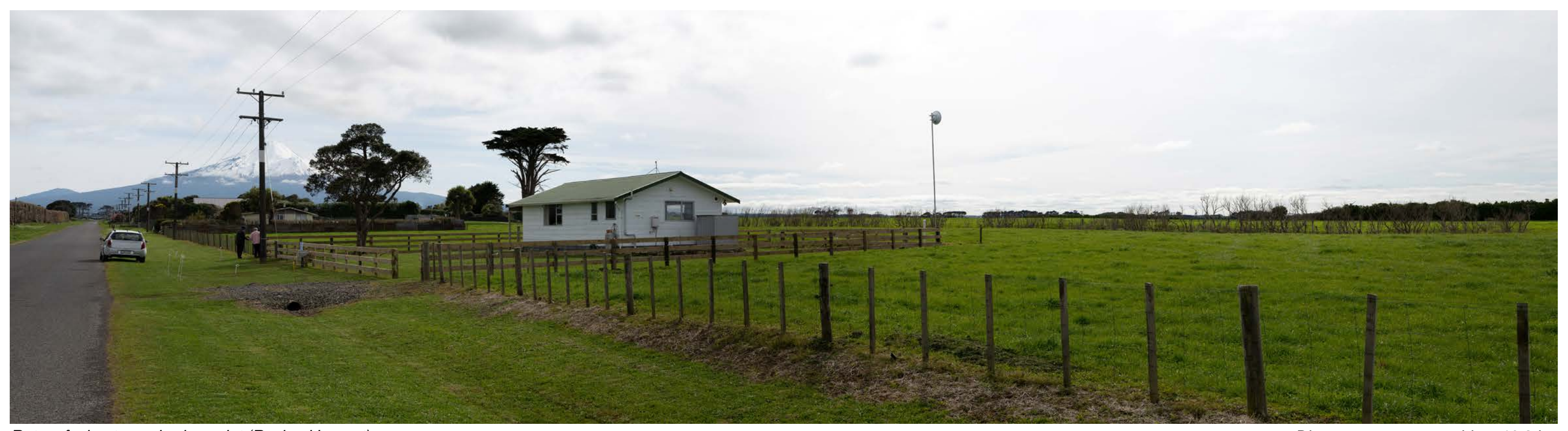
Rotors facing towards viewpoint (Revised Layout)